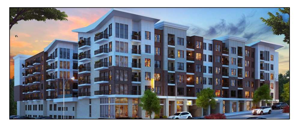
Fig. 8. 1505 Demonbreun

Both the interests of the City and various stakeholder groups were taken into account by ensuring the development encouraged pedestrian mobility, included attractive public spaces and activated the streetscape, as required by the guidelines of the form-based overlay. The city of Nashville and the citizens of Nashville also benefited as a result of the project being approved relatively quickly, because the job creation, taxation base, and general synergistic benefits were accelerated. The developer expressed a high degree of satisfaction with the entitlement process and praised the municipality for establishing clear design standards and enforcing them in a consistent manner.