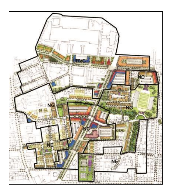
Fig. 8. Haynie-Sirrine Neighborhood Master Plan, / Small Area Plan, Greenville S.C. The Lawrence Group

Small Area Planning: Form-based codes adopted as part of the small area planning process can be beneficial because they establish clear standards for future development, which are vetted through an intensive public process involving multiple stakeholder groups. This provides an opportunity to align the interests of public officials, local residents and real estate developers when regulatory requirements are put in place to supersede previous zoning categories. Developers are provided with the ability to construct conforming projects by right; residents are given confidence that new development will reflect their vision for the area; and the public sector is able to ensure planning concepts are supported by the underlying zoning ordinance. The resultant code is not intended to be stagnant and can be modified as circumstances change, but this must be done cautiously to provide predictability in both the regulatory environment and the urban character of different parts of the neighborhood that have been established by the code. As for the downside, incorporating form-based zoning into the small area planning process can be time consuming because urban design details must be developed at a sufficient level to reveal the development potential for each site in a neighborhood, which ultimately provides the information needed to draft the code. A good example of form-based zoning in a small area plan can be found in Greenville, SC as illustrated in Figure 8 below.