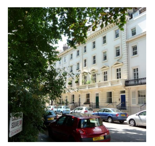
Fig. 1. Housing at Ecclestone Square, Belgravia, London, UK.

Both historic and contemporary examples of form-based zoning illustrate the potential advantages of this type of land use regulation. When aristocratic landowners developed their holdings west of the medieval city of London in the 19<sup>th</sup> Century, in what are now Bloomsbury and Belgravia, codes were created to create a standard type of development suitable for the times -- residential squares lined with impressive town houses linked together with a series of connected major and minor streets. These codes, here in the form of restrictive covenants, covered many of the details of building scale and external appearance, enforcing relative uniformity of urban character. By contrast, the backs of the properties were far more flexible, and the interiors of the dwellings were often individually customized to owners' requirements. These internal spaces and rear façades have seen many generations of changes of use and a myriad of different plan arrangements, but with almost no changes to the public front of the buildings that frame the public spaces of the streets and squares. (See Fig. 1.) This example of codes that protect and enhance the quality of the public realm, while providing significant flexibility in internal uses and spatial arrangement to property owners and developers, is key to contemporary issues in form-based coding.