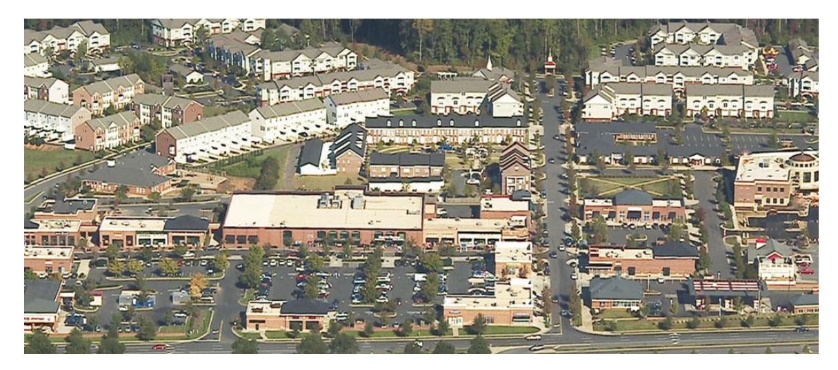
Fig. 2. Rosedale multi-use development, Huntersville, N.C. Shops, offices and housing line a network of public streets. The Harris Teeter grocery store is front and center in the photograph, with a town street between the store and the parking lot.

and apartments if the market ever grows to that level of intensity. Streets, convenient to car drivers and pedestrians alike, connect to form a coherent network linking the different uses of shops, offices, and housing. The design innovation in this case was simply for the conventional fire lane that exists in every grocery store parking lot to become a public street with convenient parking as part of a connected street network.