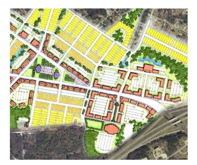
Fig. 4. Illustrative development plan for a mixed-use development utilizing a form-based code.

Note the mix of development types, ranging from grocery store (top right) and outparcels (arranged so they line the streets and screen parking lots), and a series of smaller mixed-use buildings that line the streets, screen parking lots and front onto a public park which contains new civic buildings (center left). These buildings fronting the streets may contain offices, retail, housing or any mixture of the above to suit the market.